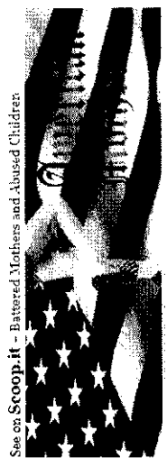
See on Scoop.it - Battered Mothers and Abused Children

Dreams Every Mother Has Them – To the Mothers – whose painful hearts, I hear.